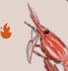
SPOT PRAWN | 牡丹蝦 SUSHI (2PCS) | 158 SASHIMI (1PCS) | 78 FRIED HEAD | +10