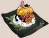
WAGYU, UNI, IKURA 158 和牛、海膽、三文魚籽