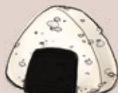
CRAB MEAT YAKI ONIGIRI | 48 燒蟹肉飯團