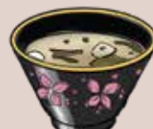
MISO SOUP | 28 麵豉湯