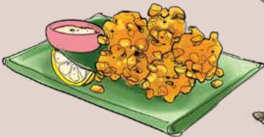
DRAGON BALLS (FRIED MENTAIKO CORN BALL) | 68 炸明太子粟米粒