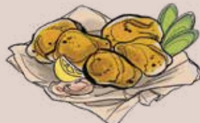
FRIED CHICKEN | 128 炸雞件