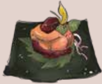
NEGITORO, SEAWEED, QUAIL EGG, TOBIKO 128 鮪魚腩蓉、海藻、鸚鵡蛋、飛魚籽