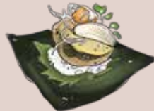
FRESH SCALLOPS, MONKFISH LIVER 108 帆立貝、鮫鱈魚肝