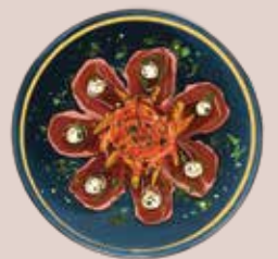
BONITO TATAKI | 138 生鯉魚片