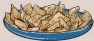
DRIED COD FISH | 48 鱈魚乾