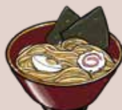
UDON | 58 稻庭烏冬