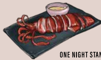
ONE NIGHT STAND (GRILLED SOY SQUID) | $98 一夜乾(醬油燒魷魚)