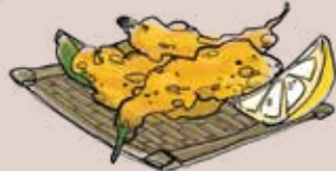
SHISHITO PEPPER TEMPURA | 78 青椒仔天婦羅