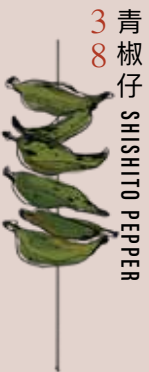
3 8 青椒仔 SHISHITO PEPPER