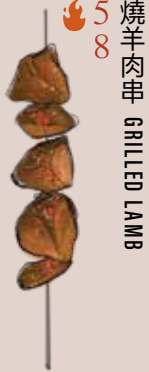
5 8 燒羊肉串 GRILLED LAMB