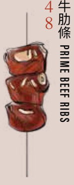
4 8 牛肋條 PRIME BEEF RIBS