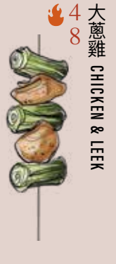
4 8 大蔥雞 CHICKEN & LEEK