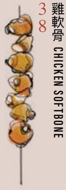
3 8 雞軟骨 CHICKEN SOFTBONE