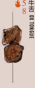
5 8 牛舌 OX TONGUE