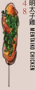
4 8 明太子雞 MENTAIKO CHICKEN