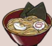
UDON | 58 稻庭烏冬