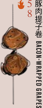
5 8 豚肉提子卷 BACON-WRAPPED GRAPES