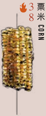
3 8 粟米 CORN