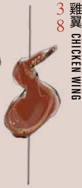
3 8 雞翼 CHICKEN WING