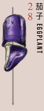
2 8 茄子 EGPLANT