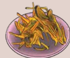
CRISPY VEGETABLE TEMPURA | 58 炸雜菜