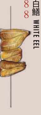
8 8 白鱈 WHITE EEL