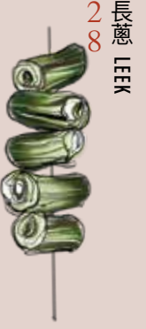
2 8 長蔥 LEEK