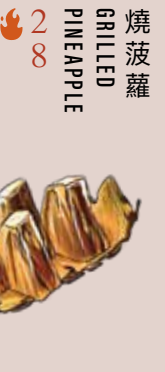
2 8 燒菠蘿 GRILLED PINEAPPLE