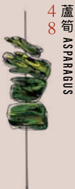
4 8 蘆筍 ASPARAGUS