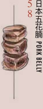
5 8 日本五花腩 PORK BELLY