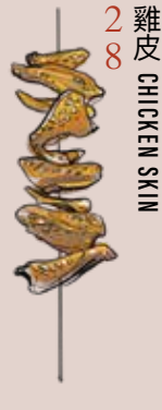
2 8 雞皮 CHICKEN SKIN