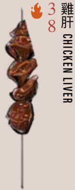
3 8 雞肝 CHICKEN LIVER