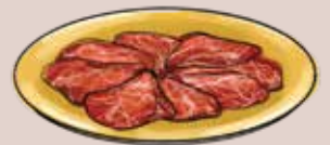
WAGYU CARPACCIO | 248 生和牛肉片