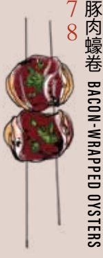
7 8 豚肉蠔卷 BACON-WRAPPED OYSTERS