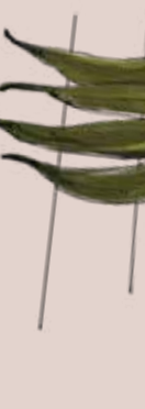
2 8 秋葵 OKRA