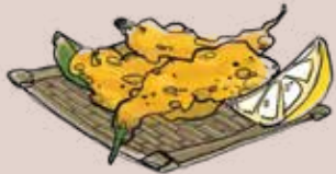
SHISHITO PEPPER TEMPURA | 78 青椒仔天婦羅