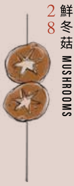
2 8 鮮冬菇 MUSHROOMS