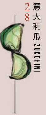
2 8 意大利瓜 ZUCCHINI